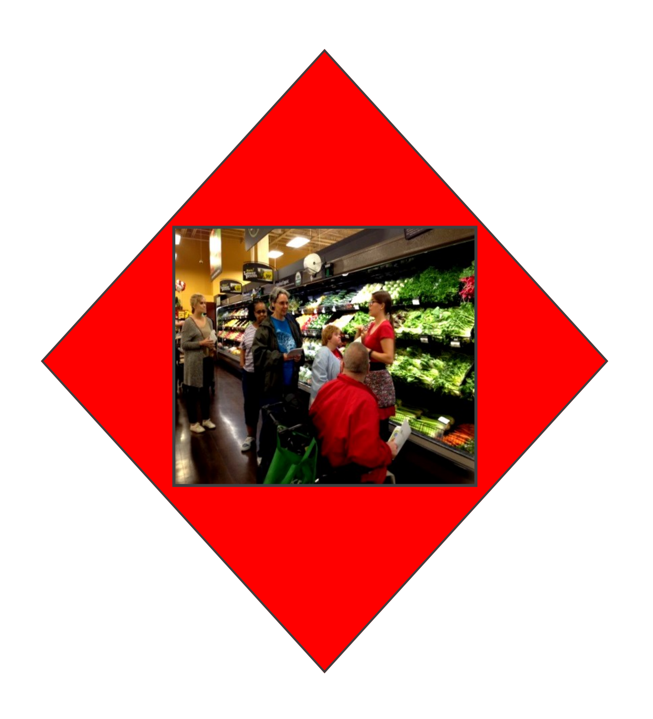
Thank you for your interest in the FCBDD 2016 Annual Report!