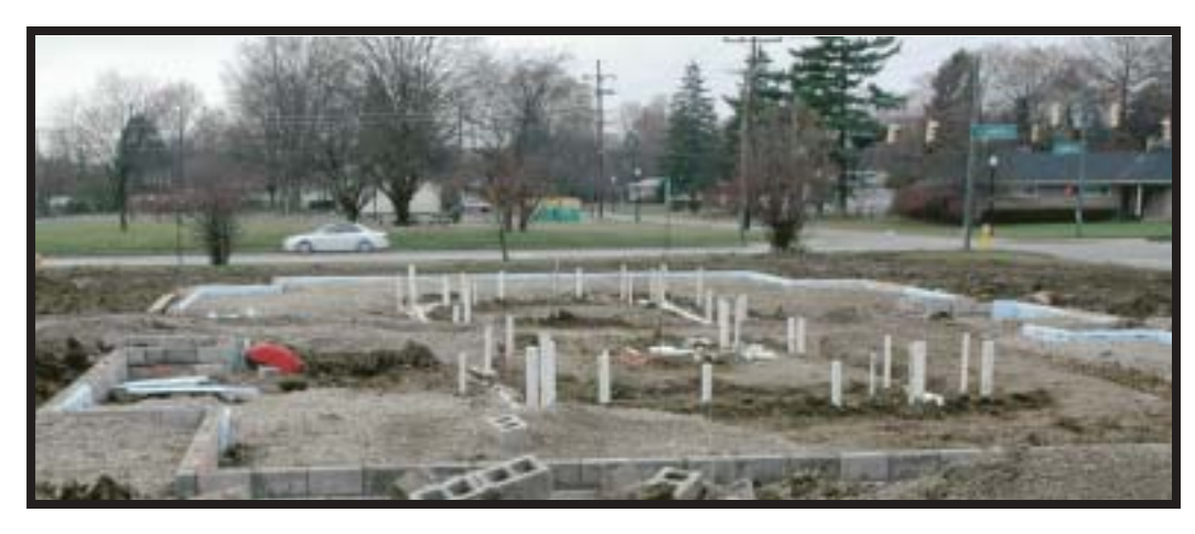
Meanwhile work is continuing at the South James and Scottwood location.

The grant, in the amount of $857,000, is earmarked for the proposed "Apartments at Stoneridge" project in Gahanna. Creative's 4-year total in committed federal funds is over 4 million dollars.