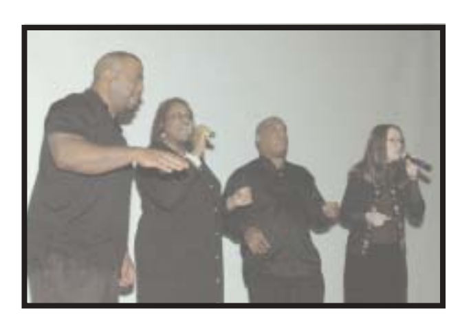
Vocal Impact provided the National Anthem as well as a program of inspired vocal standards.