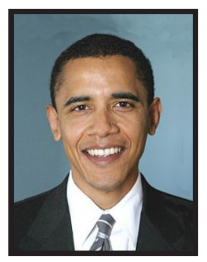
Senator Barack Obama

The Ohio Disability Vote Coalition provided signs to remind people to register to vote. For details, please contact the coalition at 866/ 575-8055.