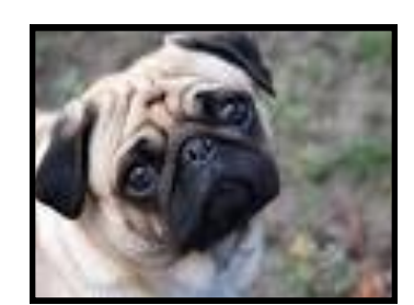
For more information on Ohio Pug Rescue, please go to ohiopugrescue.com.