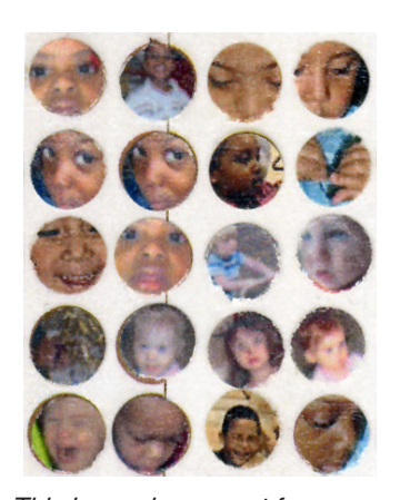
This is an elargement from 1 inch by 1 1/2 inches of the portrait.

"The next step was to print out several hundred very small photographs of the children that have been taken over the years here. I used a hole punch to cut out the parts of the photos that I wanted, and then glued each little photo onto the circles of the pixelized image."