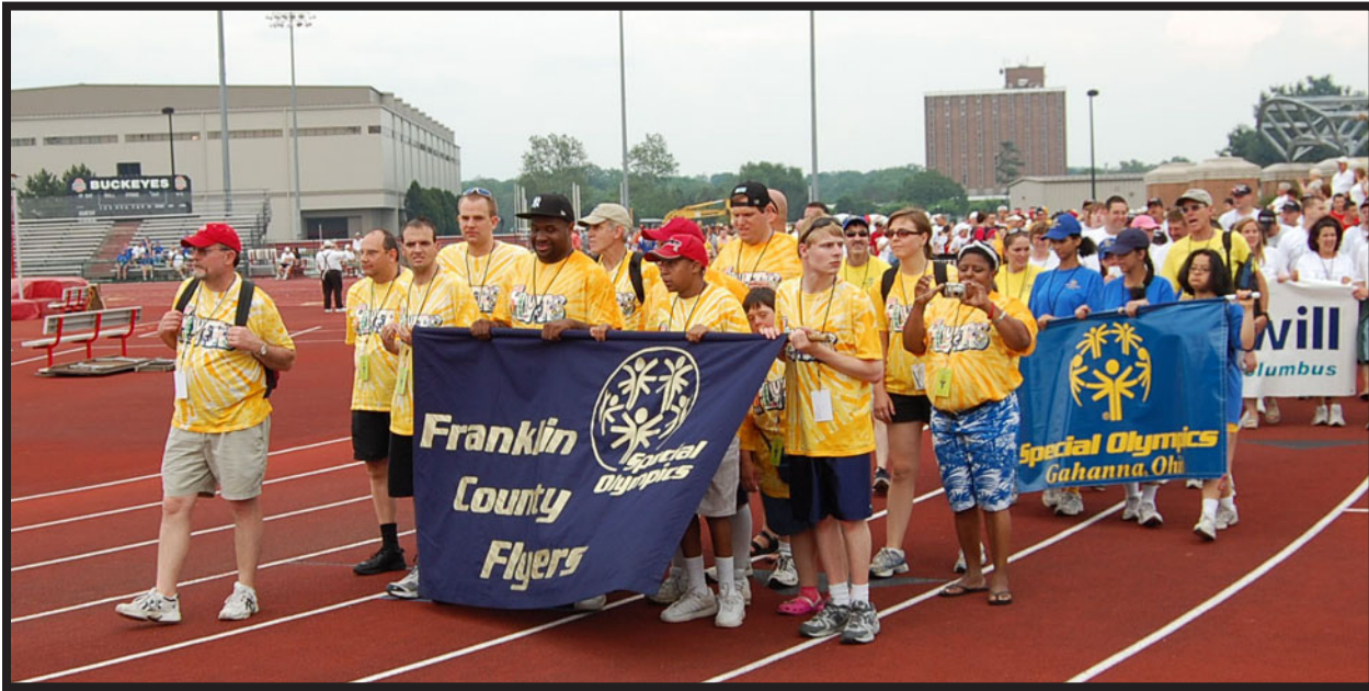
The Flyers were off to a good start at the parade of athletes during opening ceremonies.