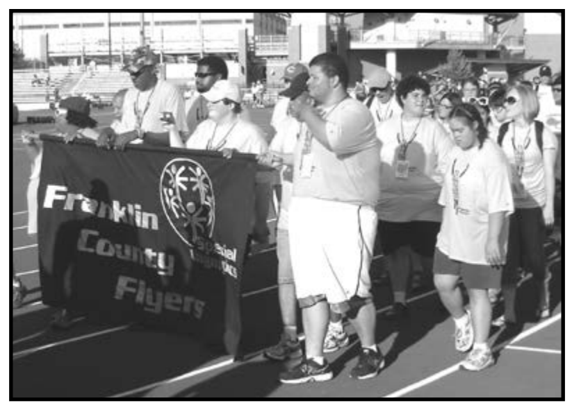
Flyers athletes and coaches at opening ceremonies.

These stories and countless others are what make Summer Games the highlight of many a Special Olympian's summer. Many thanks to the countless volunteers and supporters who made this experience possible.