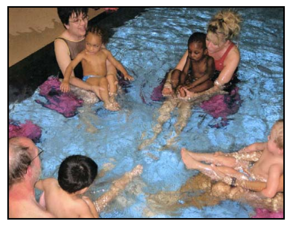
ECE and Aquatics staff members and participants work in circle activities.

The aquatics staff would like to extend a heartfelt "thank you" to all teachers, therapists and family members who get in the water and help students enjoy their time at the pool. Without this help, all of the benefits of the swim program would not be possible.