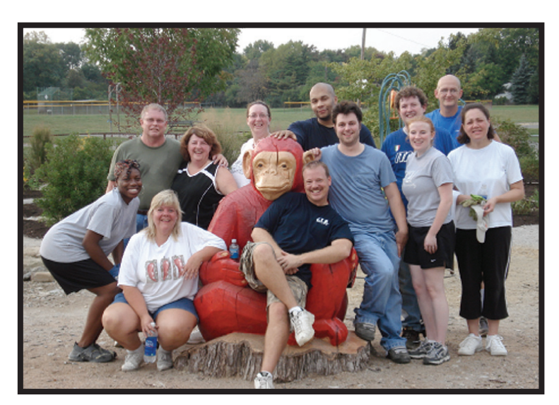
The Anthem volunteeers pose with red monkey on the playground at the Early Childhood Learning Community.