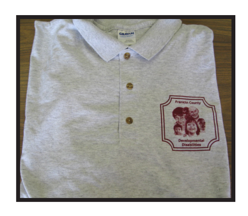
FCBDD hoodie and golf shirt shown here.