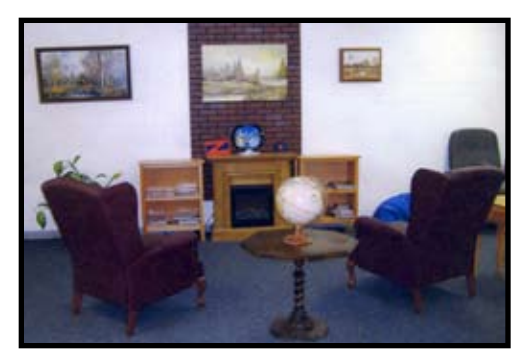
New room features soft lighting and 2 fire-

Sample activities offered include: music, memory games, individual activities, crafts, gardening and simple food preparation. Training Specialists William Fann and Brad Zubovich oversee the group with assistance from Senior Companion Charles Ross.