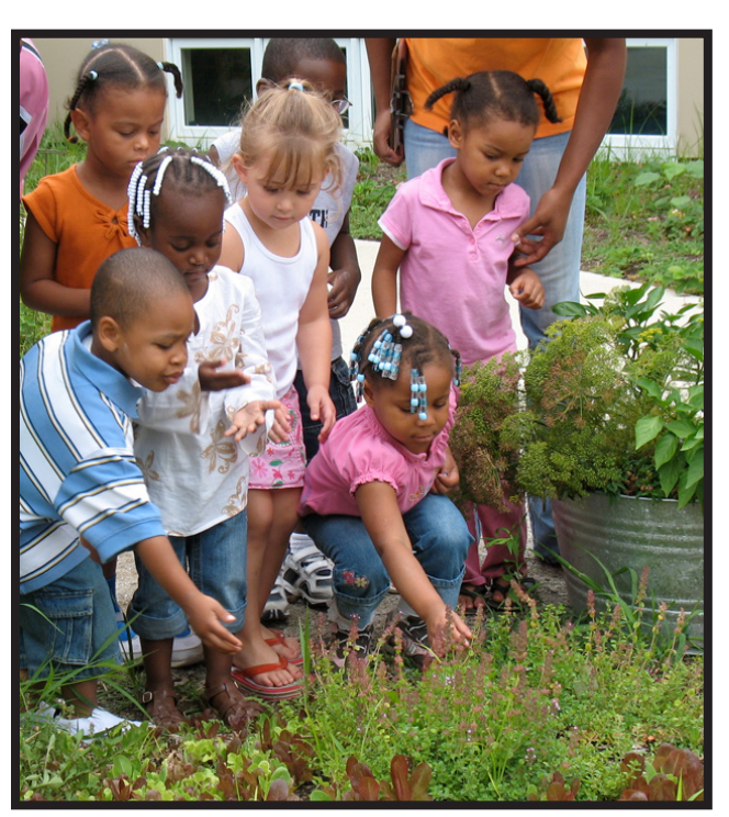
YMCA preschoolers shared the experience of working in the garden and then eating their crops.

The program has introduced the children to growing produce as well as healthy eating. The children made salads from vegetables grown in the garden.