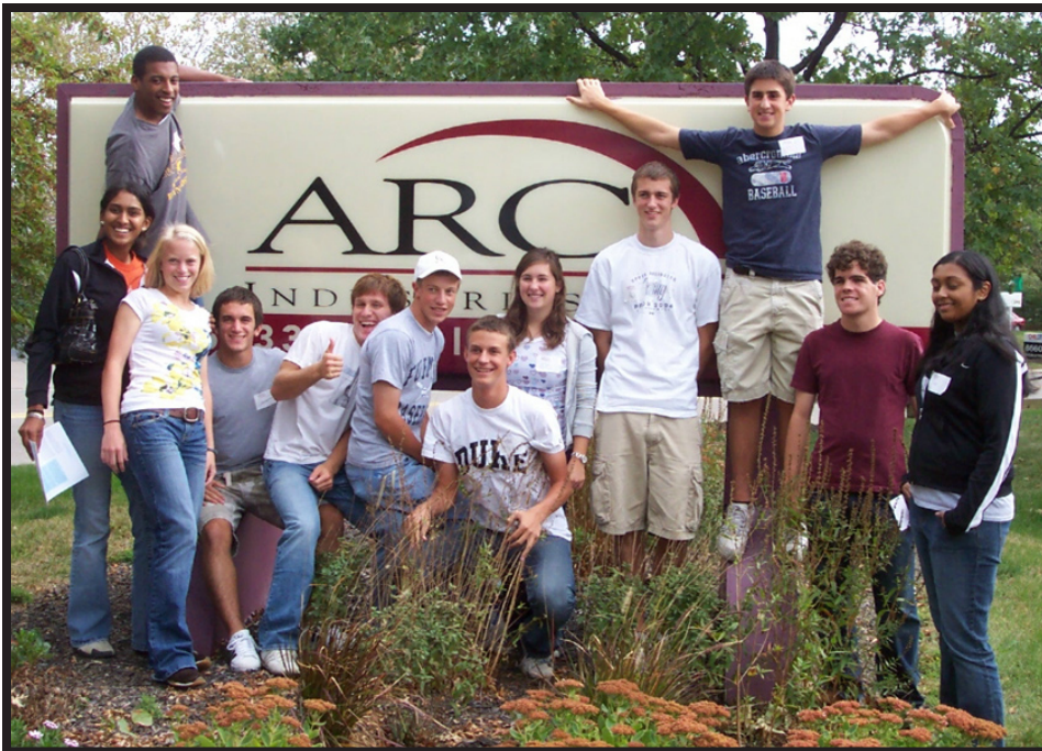
Columbus Academy students named above.