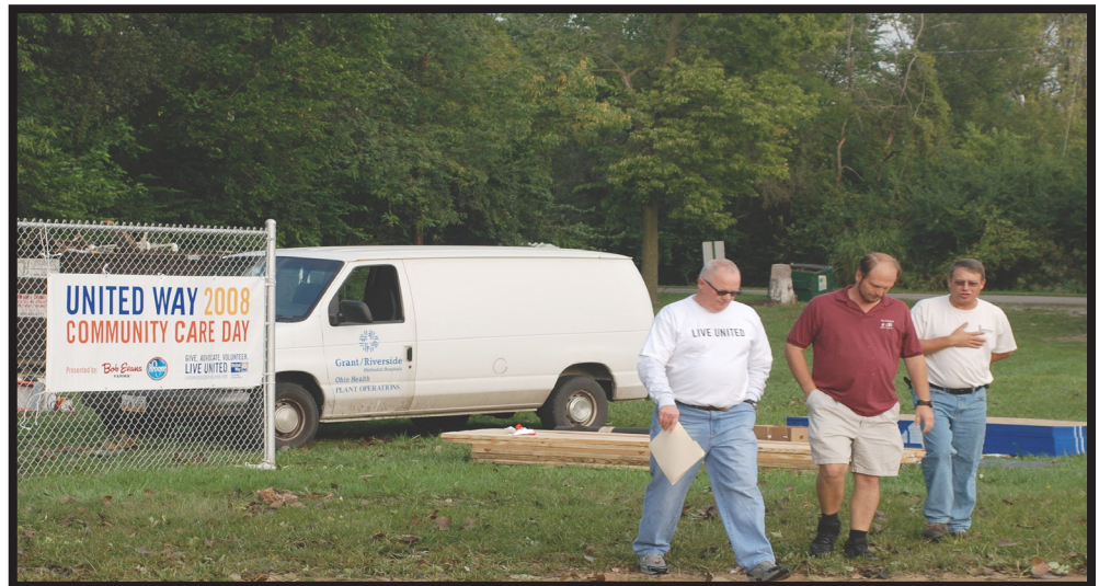
Ohio Health volunteers from Riverside Hospital plan their next move.

On September 16th, forty-one representatives from Grant, Riverside, Grady Memorial, Dublin Methodist, Doctors Hospital, Neighborhood Care, and the corporate office of Ohio Health, pulled together to make a dream come true.