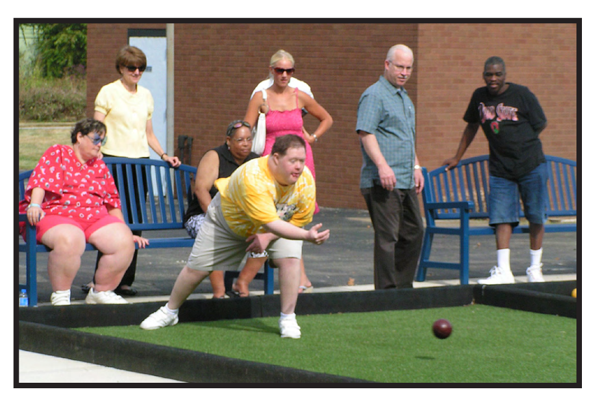
After the dedication, many people wanted to try state-of-the-art courts.