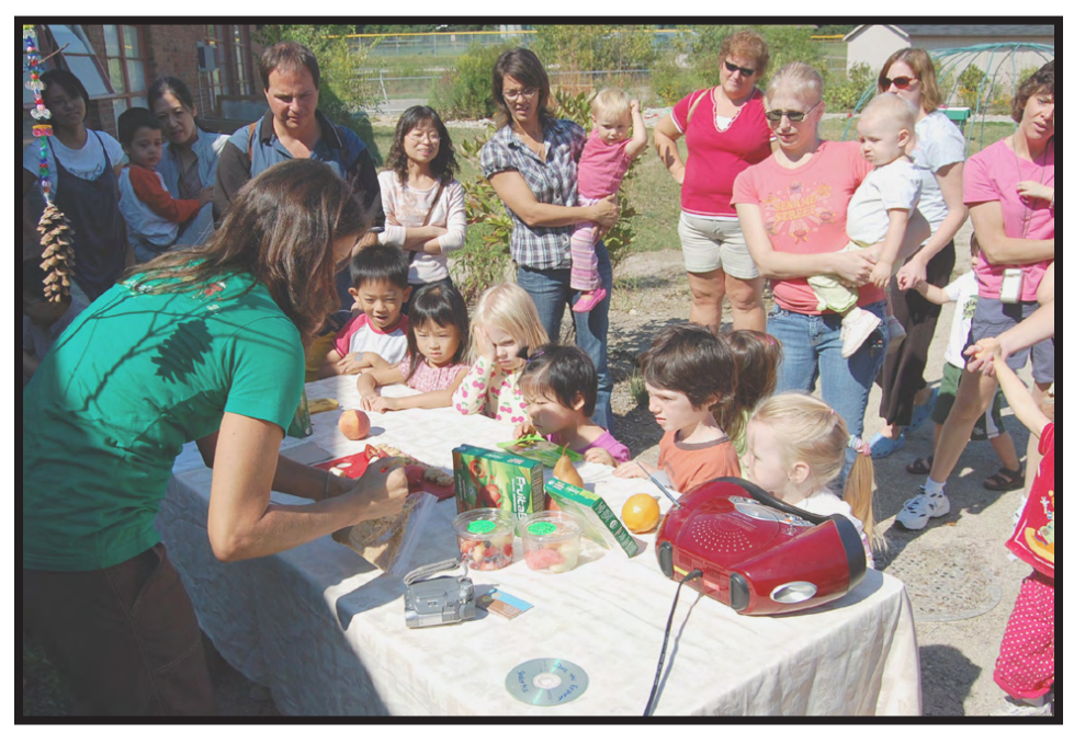
Students and parents were treated to an informal demo on ways to include more fruit in their diets. Sampling the treats was the favorite activity.