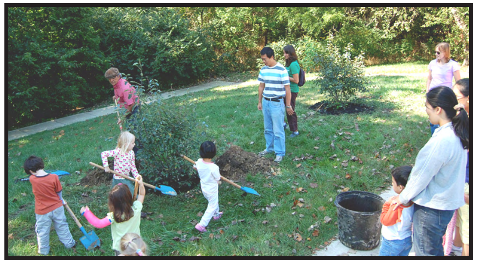
ECLC students are quick to help in the planting of theis serviceberry.