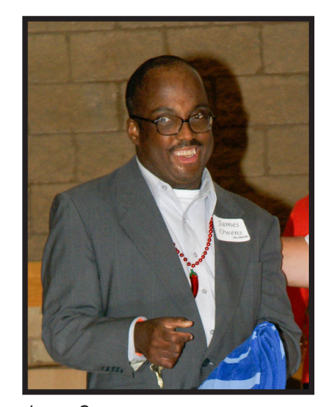
Lines a loss