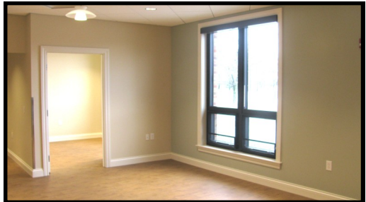
Natural light creates a pleasant effect.