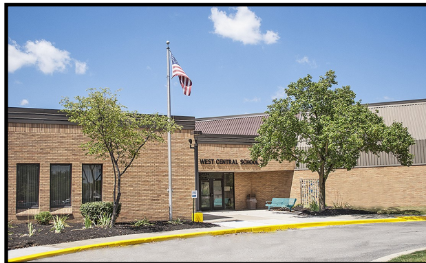
West Central School

The Board will meet at West Central School, 1481 West Town Street at 1:00 p.m. on Thursday, March 26, 2015. For the past two years, the Board has held some of their meetings at various early childhood, school and adult services sites and received a tour of the buildings and overview of services provided.