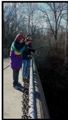
Students at Griggs Reservoir.