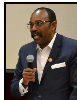
Rep. Hearcel Craig