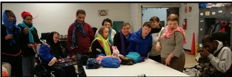
Individuals at ARC North helping out those in need.

If interested in doing a similar activity, please contact Debbie Rambo at Maryhaven's Outreach Team at 449-1530.