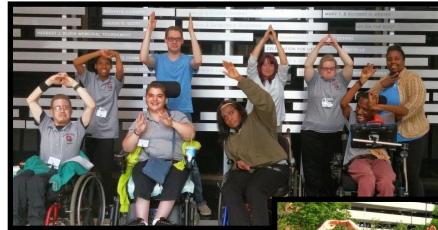
Some of the individuals participating in the PIECE program show their enthusiasm.