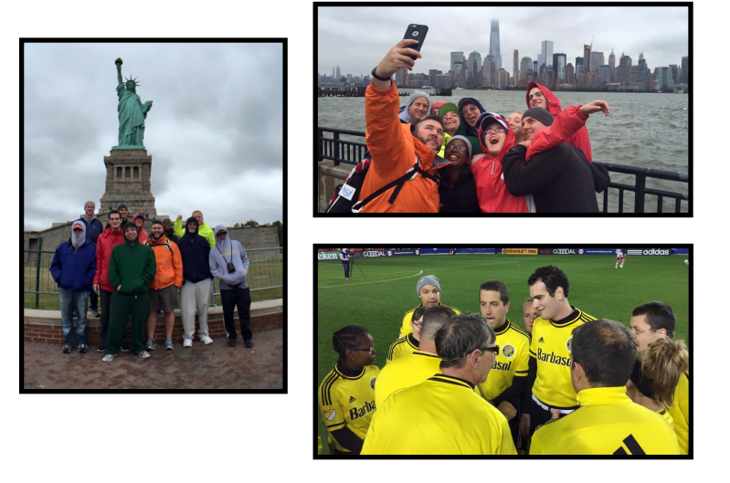
More photos of the Special Olympics New York Soccer trip can be found on he <u>Franklin County Special Olympics</u> Facebook page.