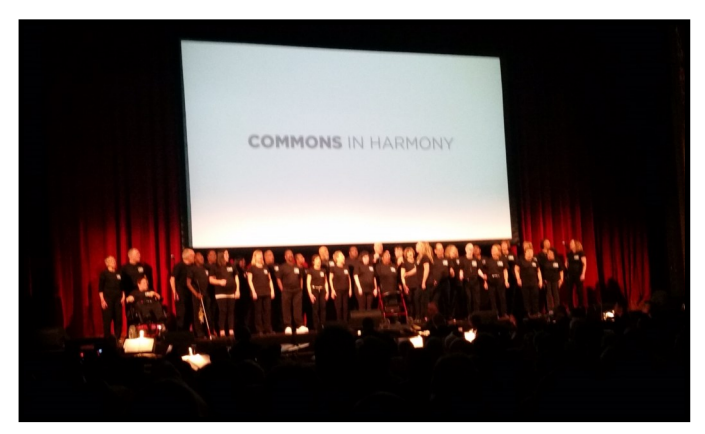
Commons in Harmony performance on December 1st.