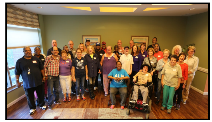
ARC Industries singers join Commons in Harmony choir members .