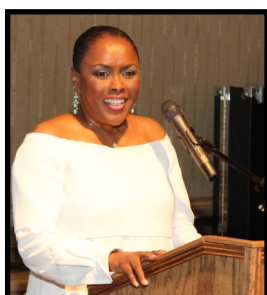
FCBDD Board President closes the evening with a few remarks.