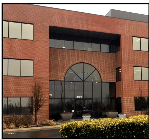
2780 Airport Drive Columbus, Ohio 43219

The Marilyn Lane building will continue to be used for maintenance and storage, while plans are developed to move these functions to the former West Transportation Compound building.