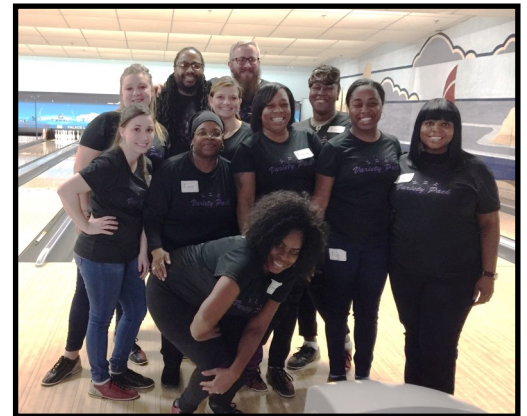
Bixby Teams - Best Bowling Shirts

It was a great day and all funds raised will benefit the Franklin County Special Olympics program.