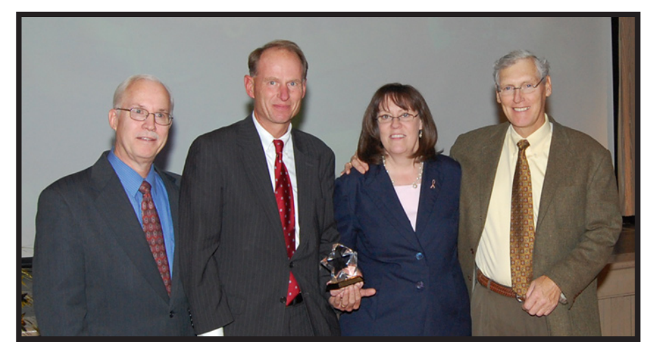
United Cerebral Palsy was honored as the Provider Organization.