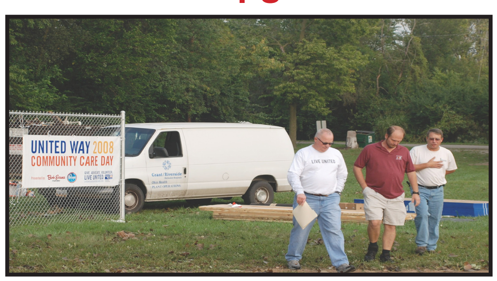
Ohio Health volunteers from Riverside Hospital plan their next move.

On September 16th, forty-one representatives from Grant, Riverside, Grady Memorial, Dublin Methodist, Doctors Hospital, Neighborhood Care, and the corporate office of Ohio Health, pulled together to make a dream come true.