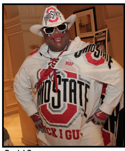
Buck I Guy