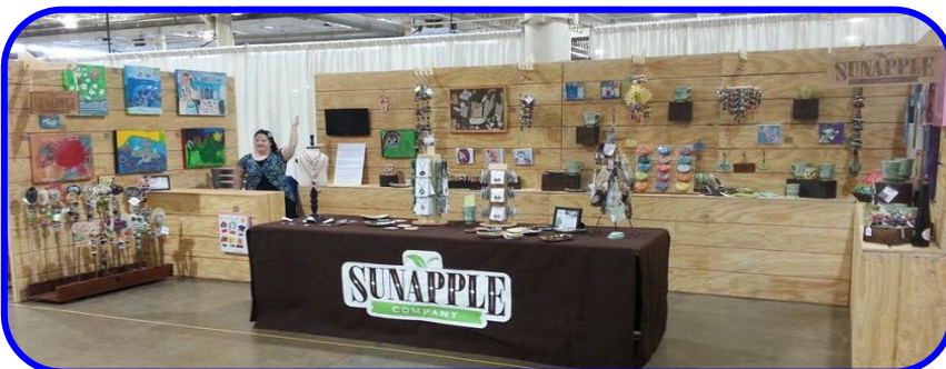
Sunapple Products, a Division of ARC Industries, sets up a dazzling display at Winterfair.