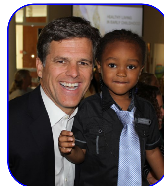
Timothy Shriver, President of International Special Olympics, visits FCBDD Early Childhood programs.