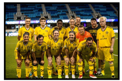
Franklin County Special Olympics United Soccer Team in San Jose.

For more information on Franklin County Special Olympics, go to <a href="https://www.facebook.com/FranklinCoSpecialOlympics">www.facebook.com/FranklinCoSpecialOlympics</a> or call 614-342-5989.