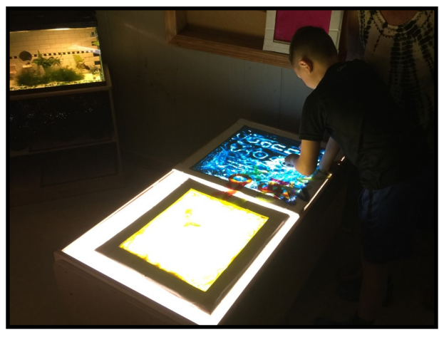
The Early Childhood Learning Community (ECLC) hosts 'An evening with the Arts.'