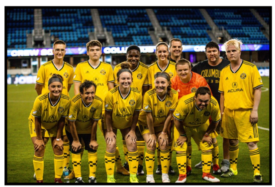
Franklin County Special Olympics Unified Soccer Team in San Jose.