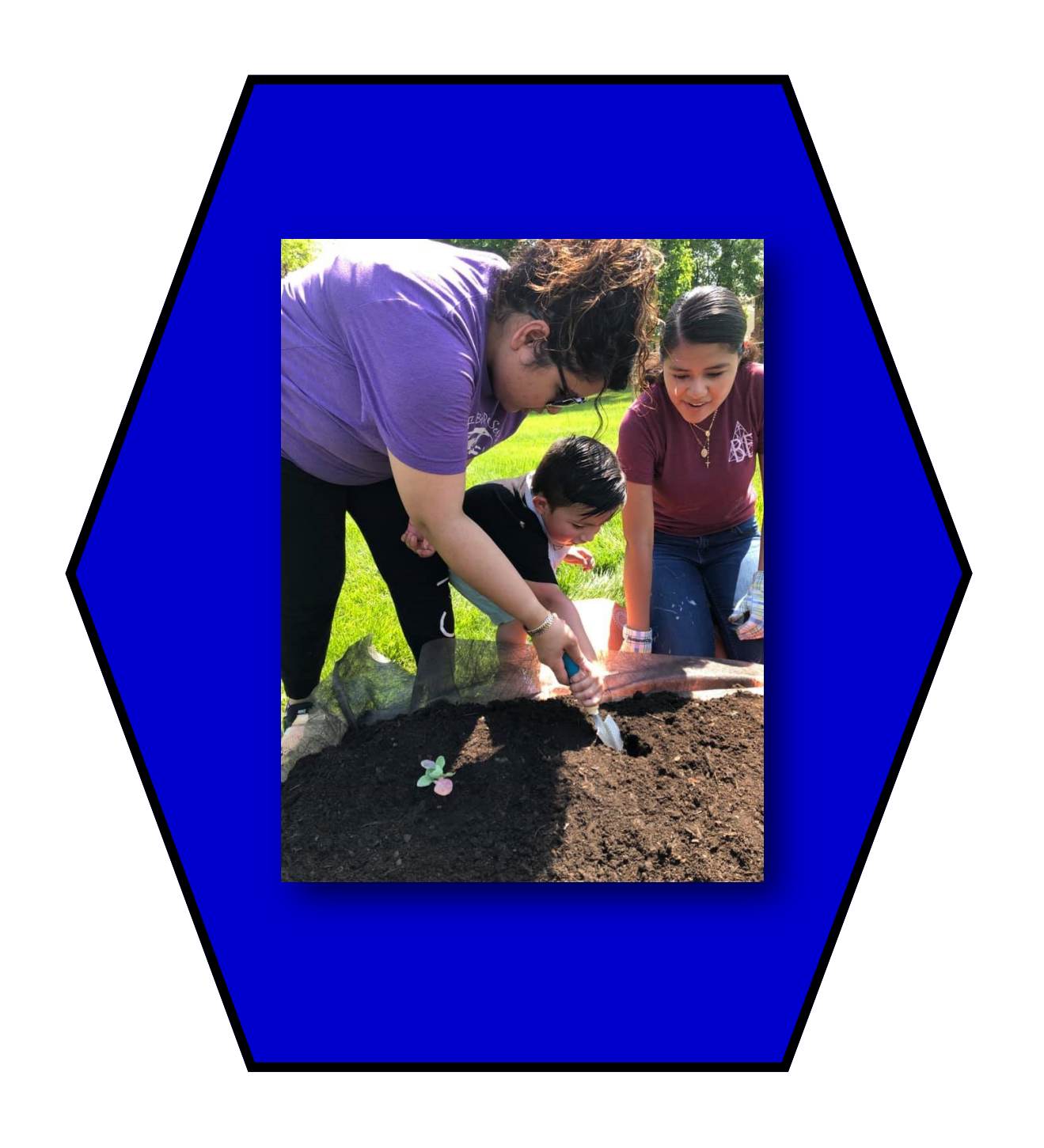
Thank you for your interest in the FCBDD 2019 Annual Report!