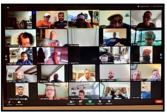
Franklin County Flyers re-connect with each other on a Zoom call for athletes and coaches

To follow our Boredom Buster adventures and more, find us on Facebook: Franklin County Special Olympics.