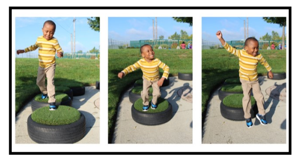
Children enrolled in our Early Childhood Education program spend extra time utilizing outdoor learning environments!

Beginning with Transportation, Bus Drivers or Assistants take the temperature of all students before they board the bus. Then seats are assigned to maintain as much social/physical distance as possible. Bus staff wear face coverings and Transportation staff have regular protocols to sanitize the buses after each trip with electrostatic mist sprayers.