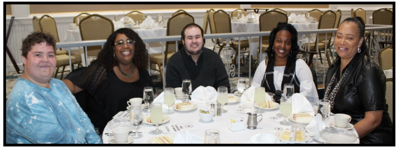
There were smiles all around at this Goodwill table.