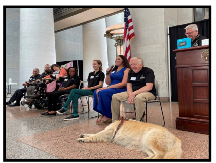
Ohio Tech Ambassadors gathered for a celebration at the Statehouse.

Since 2021, Tech Ambassadors from all over the state have held events and provided peer-to-peer mentoring to show people with developmental disabilities how assistive technology can be used to boost independence and enhance their day-to-day lives.