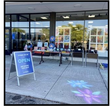
Volunteers and shoppers are welcome to visit the new studio.

Early this year, the art studio and gallery celebrated its opening at 50 Robinwood Ave. in Whitehall, just off E. Broad Street.