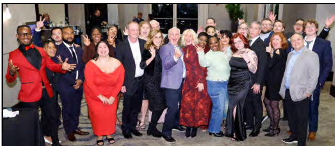
Community Star winner for Provider Organization Upreach, LLC - Congratulations!