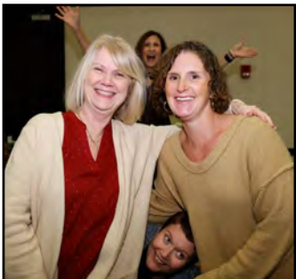
Early Childhood staff shenanigans!